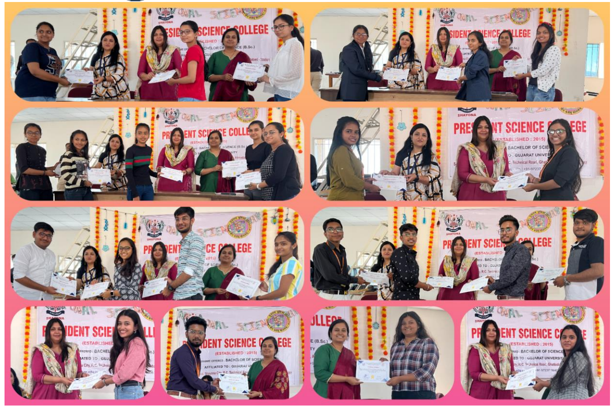
Rankers rewarded by Certificate