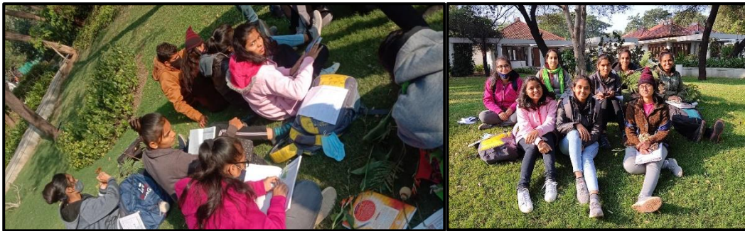
PLANT PRESSING FOR HERBARIUM

Besides studying plants, students also got chance to collect plant specimens for herbarium preparation. Our expert provided some tips on plant pressing, fixing and also provide information about herbarium label. Students have pressed plants in garden only under his guidance.