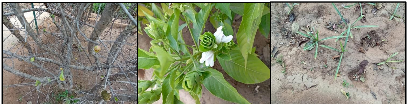
MEDICINAL PLANT DIVERSITY

Along with wild plant species, students have also studied a number of medicinal plants planted in a patch developed as a medicinal garden. They also have observed pond ecosystem along with its components i.e., plants and birds visiting it. A small portion of garden is used to cultivate vegetables also where students have experienced that how vegetables are cultivated singly and in mixed cropping.