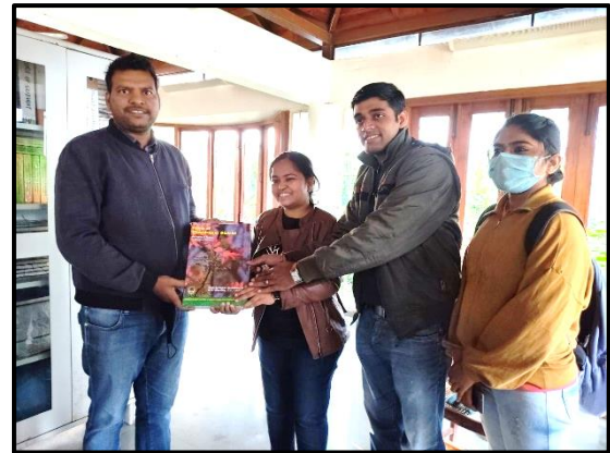
MOST VALUABLE GIFT

After Serenity visit, Students and faculties had a small refreshment and then proceeded for next destination i.e. Koteswar Mahadev temple. During the short visit to temple students have also observed the garden design and topiary in the premises of temple.