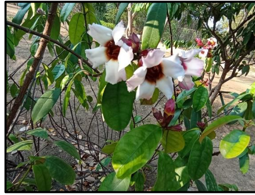
PLANT DIVERSITY IN SERENITY BOTANICAL GARDEN