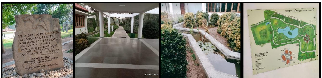
SERENITY LIBRARY AND BOTANICAL GARDEN

The Serenity library and garden is a lavish green place with 800 species of indigenous & exotic plants which have been planted over the last 20 years. The garden hosts more than a 100 species of birds in the wild, venomous and non-venomous snakes. The botanical garden has two excavated water bodies with several aquatic plants which play a vital role in attracting birds to the premises. It also has a rich library containing 3,000 books on environment, wildlife & conservation along with herbaria and seed bank. With all these qualities, serenity library and botanical garden make a wonderful place to study plant taxonomy, different ecosystems including interaction between plants, animals and birds.