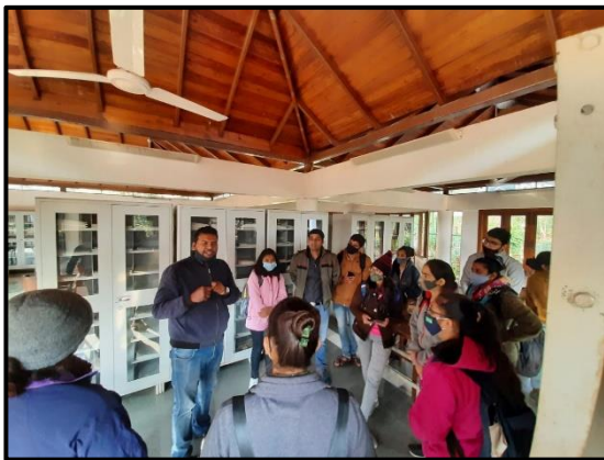
EXPERT ADVISE ON PRESERVATION TECHNIQUES