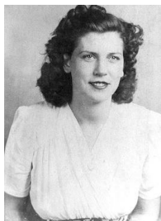
Margaret E. Knight