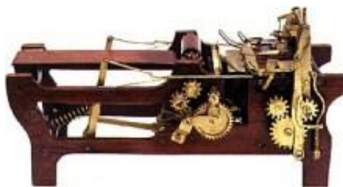
Patent model of Knight's machine for making paper bags, 1879