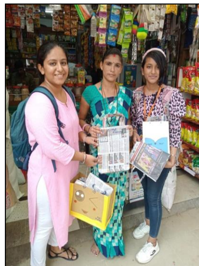
Distribution of Paper Bags by students and faculties of President Science College to local retailers