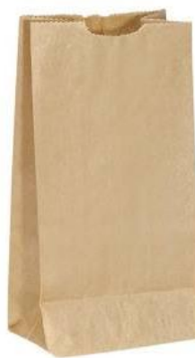
Kraft paper bag